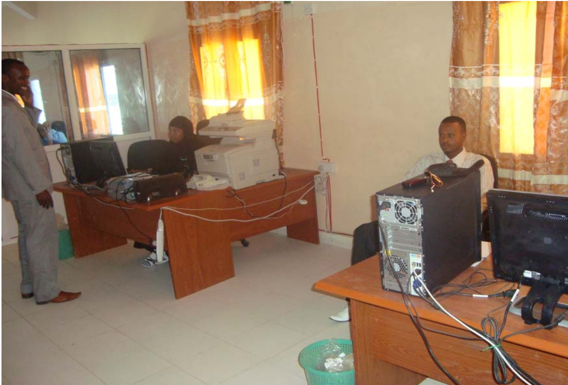
Picture1. Shaqodoon staff at Las Anod Resource centre

enjoy the recreational, cultural and educational activities offered by HAVOYOCO. Similarly, SOYVO and ILAYS, both local sub-award partners, have provided space in Burao and Las Anod respectively to be used as resource centres as part of the terms of their sub-award agreements.